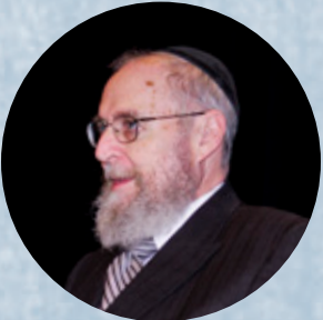
RABBI SHEFTEL NEUBERGER